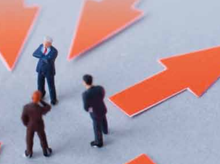
* Figures are provided for illustration purposes only and should not

If you would like open, honest and transparent advice then please do not hesitate to get in touch with myself or one of my team. We would be more than happy to have a nonobligatory discussion with you to see if we can help.