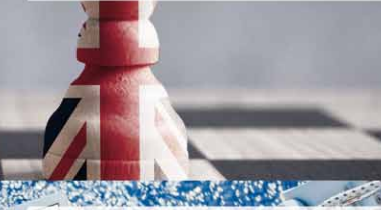
The golden rules of financial success for Yacht Crew P20-21